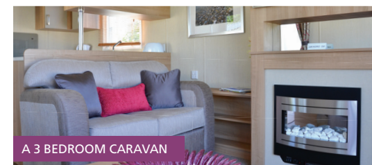
A 3 BEDROOM CARAVAN

"Carnmoggas is a small, family run, pet friendly, Holiday Park situated on the south coast of Cornwall near Mevagissey, open all year round and located in rolling countryside with extensive views"